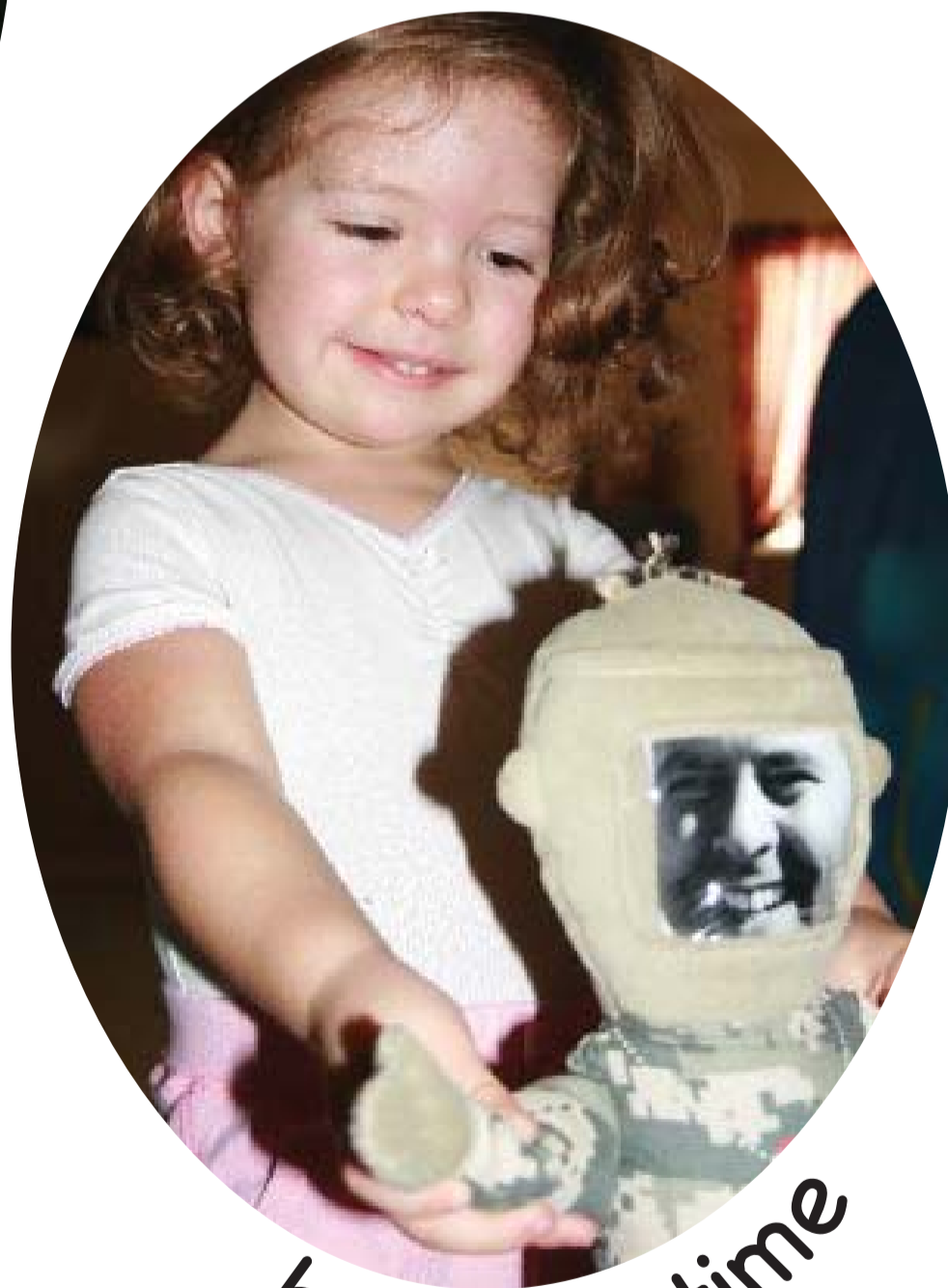
had play time