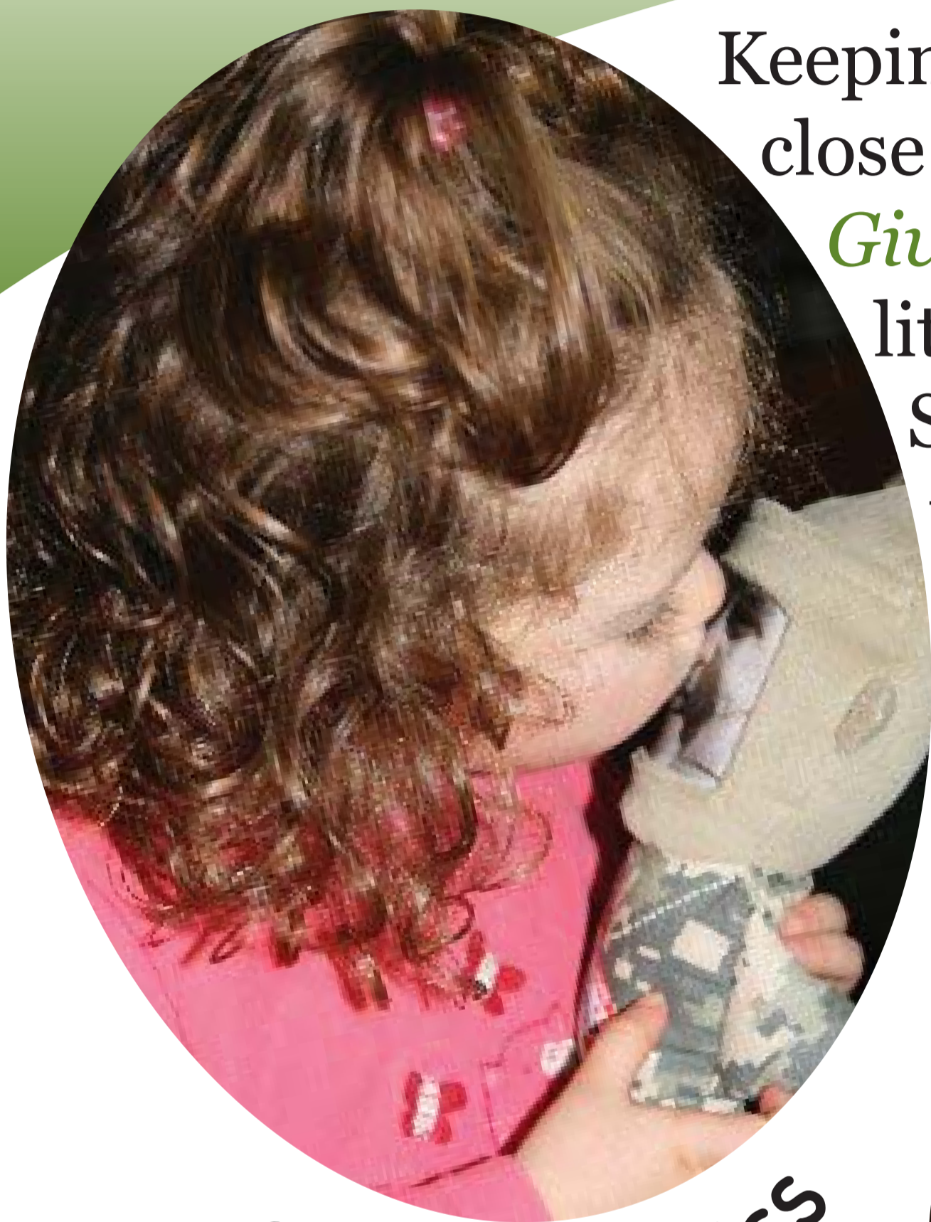
got a BIG kiss

Keeping deployed loved ones close during deployment, Give a Hug dolls allow little Heroes to take the Soldier they miss with them wherever they go!