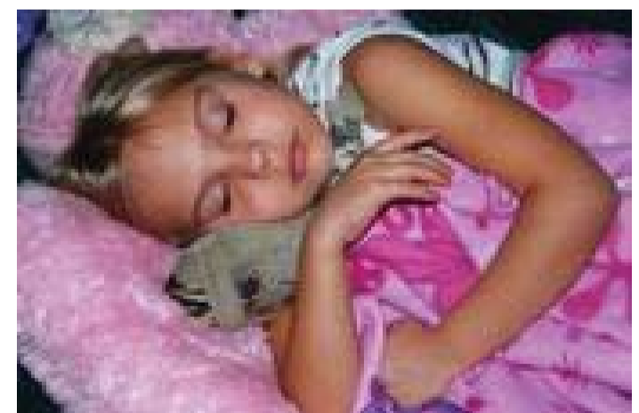
took a nap